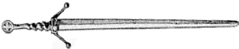
bastard sword 8 (+1)