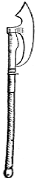
battle axe 8 (+1)