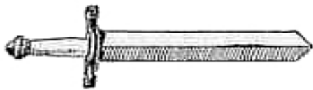
short sword 6