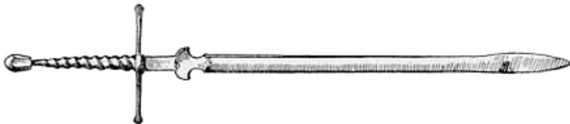
two-handed sword 10